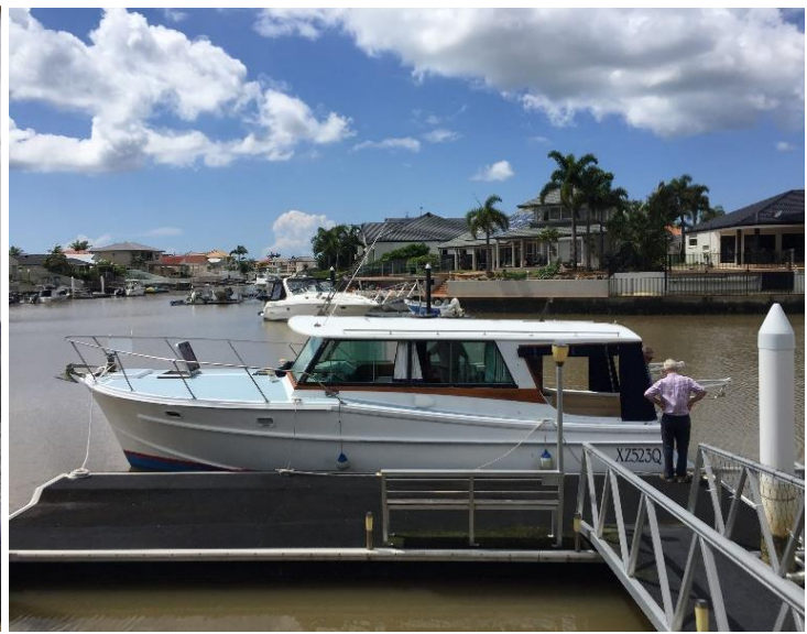
Truant III The Boat