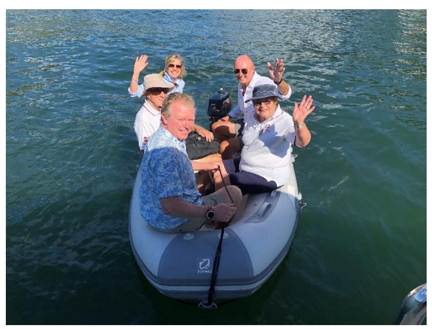
Heading off to lunch at Cottage Point Kiosk

of course, we had our final inshore challenge. Back to America Bay we headed. There was a good wind and much determination and competitiveness. Though one boat put forth a challenge all agreed it had been a very pleasant sail. Well done Delphin!