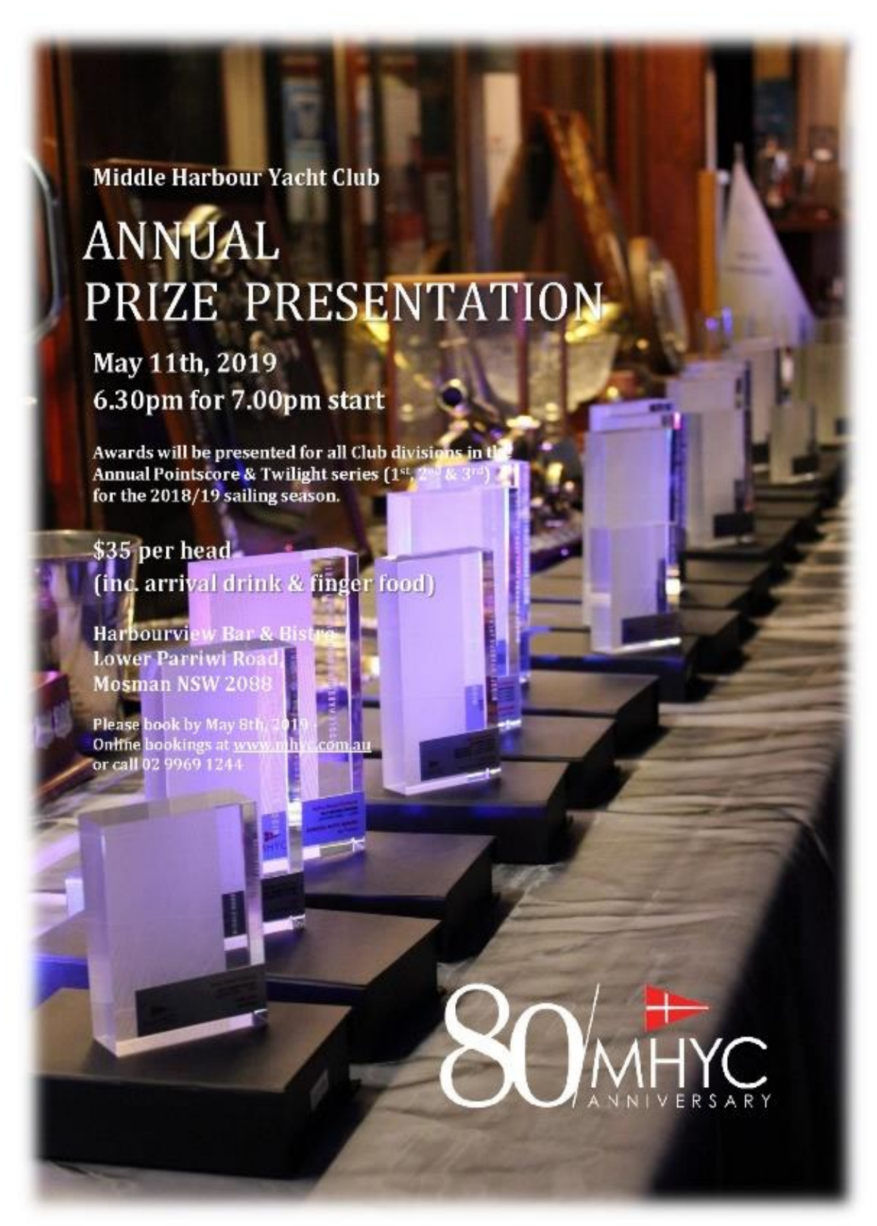
COME ALONG AND JOIN THE CRUISING DIVISION TABLE JUST MENTION THAT WHEN BOOKING YOUR NIGHT WITH THE CLUB