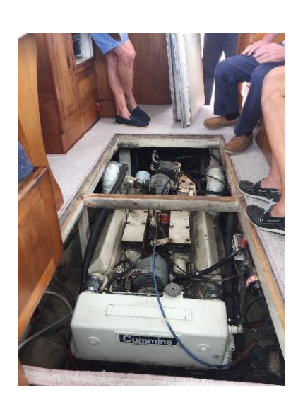
Massive Cummins diesel in The Boat