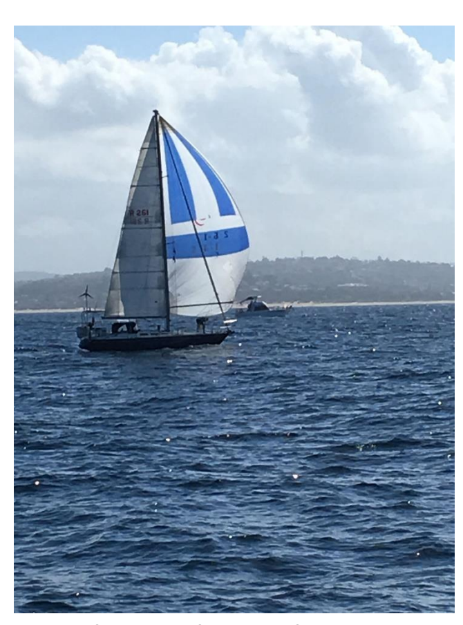
Galaxy III under spinnaker

On Good Friday, at around 10:30 a.m., a flotilla of yachts assembled in Hunters Bay in preparation for departure to Pittwater. North Head was rounded by most by 11a.m.