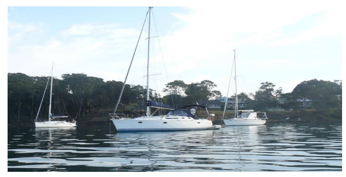
Slac-n-off, Buggalugs and Nashira on Lake Macquarie Oct 2017

The calendar had the New Year Cruise originally scheduled for 5-11 January but there has been some interest to move it into the Xmas /New Year holiday break period as some members are already off work for this period.