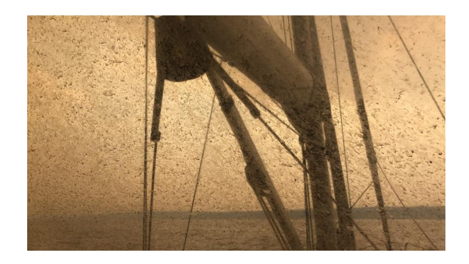
Buggalugs sails next to us