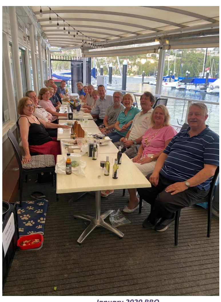
January 2020 BBQ