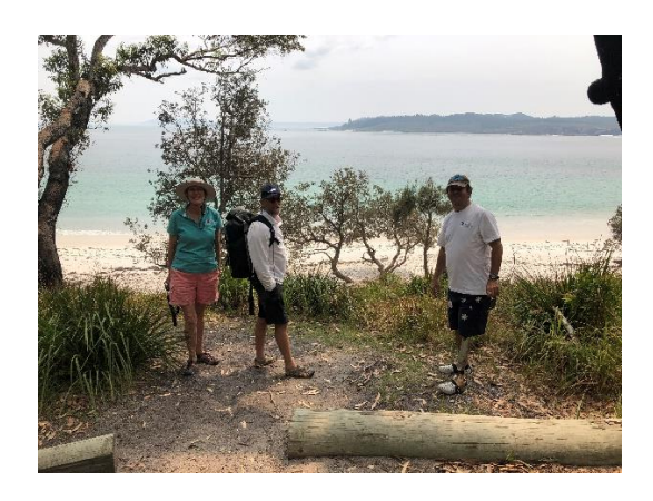
Murrays Beach Fishermans' Beach

knew were safe. Some days were clear particularly when the winds came from the east and some days were so smoky that mid-day was as dark as night.